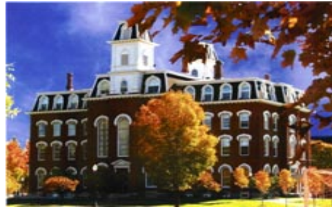
Vermont College of Fine Arts, College Hall Montpelier, Vermont