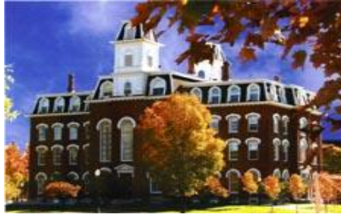
Vermont College of Fine Arts, College Hall Montpelier, Vermont