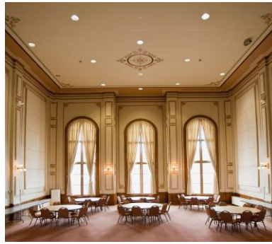
The Chapel in College Hall, Vermont College of Fine Arts, Montpelier, VT

We are excited to announce a new association with a well-known (and well-loved) local caterer who will serve all meals for Fiesta in the beautiful Chapel in College Hall. This is a more intimate setting, beautifully appointed, and closer to the classrooms.